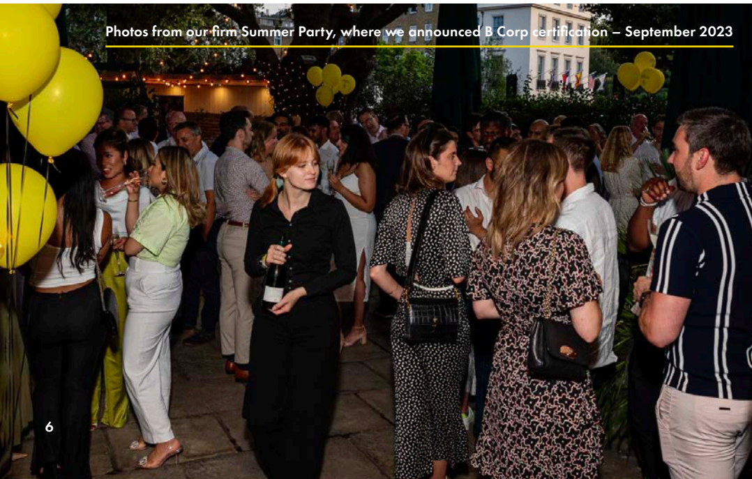
Photos from our firm Summer Party, where we announced B Corp certification – September 2023